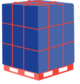
Minimum requirements for security taping.